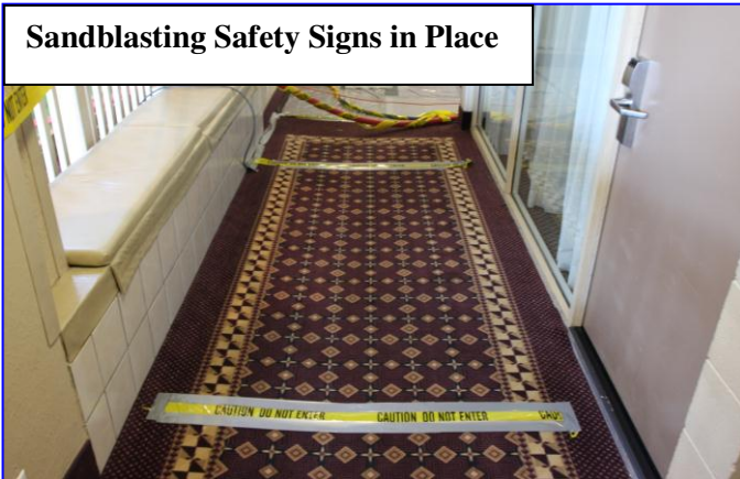
Sandblasting Safety Signs in Place